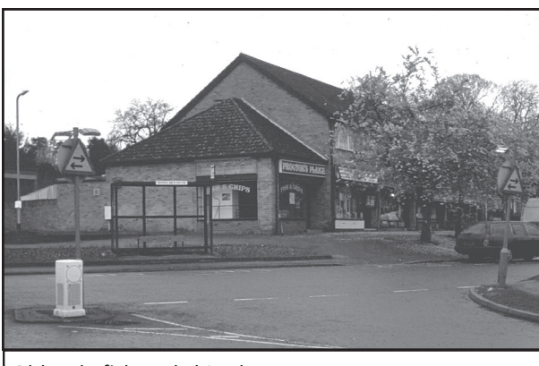
Old style fish and chip shop

These I remember, but you, the reader, could maybe add to the list Of the one-time traders I could have missed.