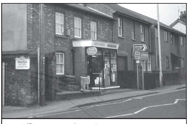
Post Office New Road Junction