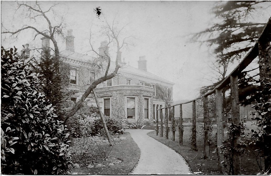
Rossway in the early 1900s